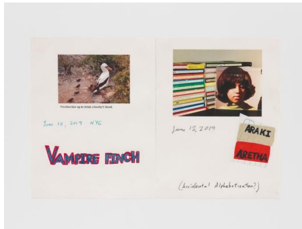
Roni Horn, "Vampire Finches • Araki and Aretha", 2022, Details aus: "An Elusive Red Figure ...", 2022, Photo: Tom Povel Imaging, © Roni Horn. Courtesy the artist and Hauser & Wirth