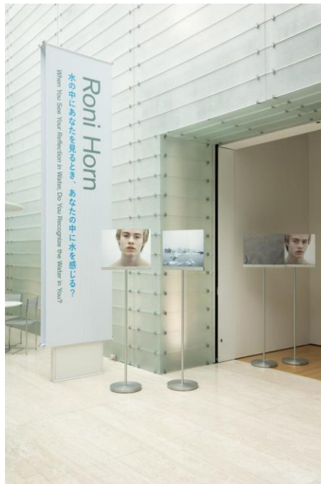
Roni Horn, "Doubt by Water", 2003-04, Detail, Ausstellungsansicht: Pola Museum of Art, Hakone, Japan, 2022, Photo: Konda Takeru, © Roni Horn, Courtesy the artist and Hauser & Wirth