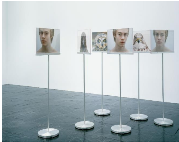
Roni Horn, "Doubt by Water", 2003-04, Detail, Ausstellungsansicht: Whitney Museum of American Art, 2004