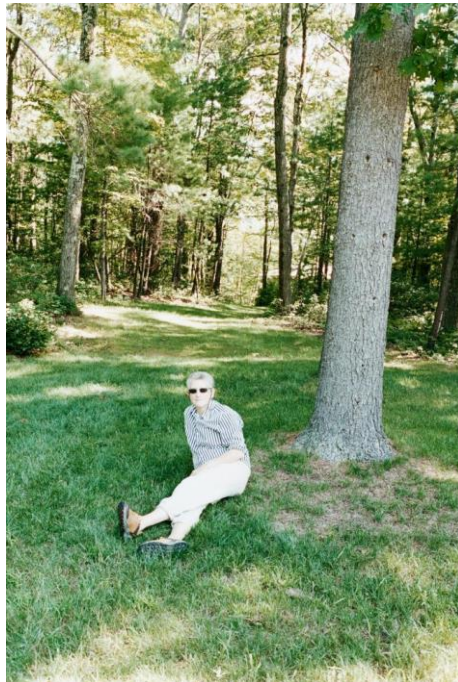
Roni Horn