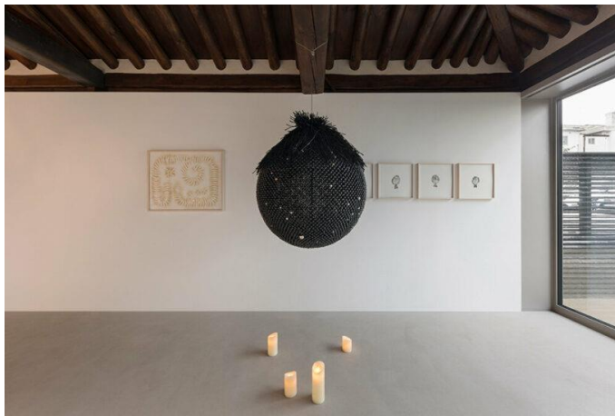
Obscure Rotating Reflective Running Black Cube-Handle Faucets – Scaly Squirrels #17 (2023)