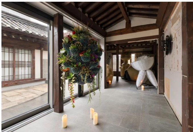
Kukje Gallery Hanok Haegue Yang Presentation, Latent Dwelling installation view

As visitors enter the exhibition, their senses are immediately welcomed by the herbal scent of Chinese medicine and the gentle flickering of electric candles spread throughout the space. In one corner of the Hanok, sculptures are casually arranged on the floor, while in another, they serve as storage containers or mimic straw sacks found in a granary. The works, densely displayed within the modestly sized interior of the Hanok, encompass various series created over different years. Yang's approach to the Hanok is unconventional, aiming to create a context where artworks exist in their own unique time and space, rather than a standard gallery setup. The artist hopes Latent Dwelling will allow her works to be experienced in a more natural manner, akin to offseason landscapes or actors away from the limelight.