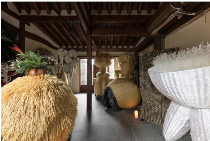
straw creatures dominate the Latent Dwelling show at Kukje Gallery Hanok