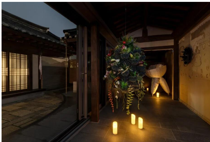
Sonic Planet Pockets – Iridescent Botanic Map (2023)