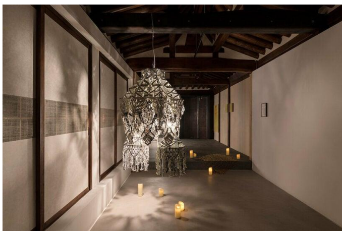
The Intermediate – Five-Legged Frosty Fecund Imoogi (2020)