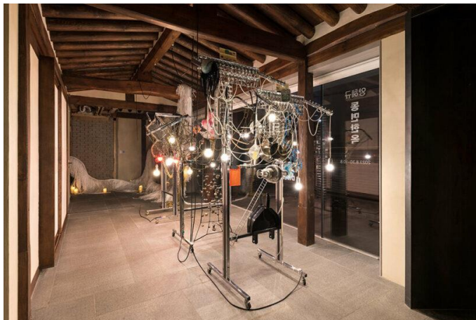
Totem Robots (2010)