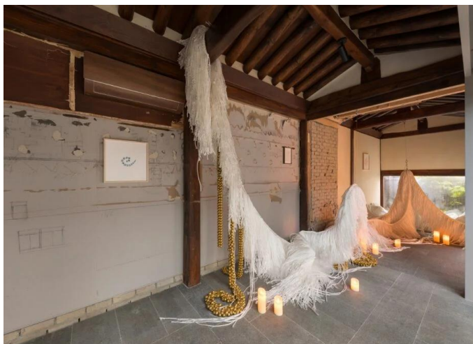
The Intermediate – Five-Legged Frosty Fecund Imoogi (2020)

Beyond this, there's a wall-mounted reflective black sculpture called Obscure Rotating Reflective Running Black Cube-Handle Faucets – Scaly Squirrels #17 (2023). Visitors then enter a relatively dark and compact rear space filled with larger sculptural pieces from The Intermediates series. Among them is Sonic Rotating Whatever Running on Hemisphere #22 (2022), as well as sculptures from the ongoing Sonic Clotheshorse – Dressage series (2020–). Finally, through a window on one side, visitors can spot The Intermediate – Seven-Legged Carbonous Male Imoogi (2023), wrapped around trees in the Hanok's backyard.