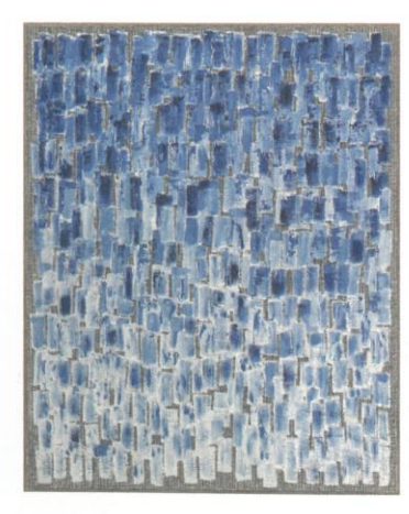
하종현 (b.1935), 'Conjunction 21-38', 2021, Oil on Hemp Cloth, 162×130cm, Courtesy of the Artist and Kukje Gallery 사진: 안천호 이미지 제공: 국제갤러리

True to his lifelong commitment to exploring the endless possibilities of painting, Ha Chong-Hyun is still engaged in a war against oil paints and burlap canvas. As a pioneer of Korean modernism, he continues to create new works driven by his passion for ceaseless exploration and experimentation with materials to expand the boundaries of painting. By constructing a unique artistic language through two-dimensional works imbued with materiality and energy, the artist cultivates an expanding spectrum of his practice to break away from Western painting techniques. This solo exhibition of Ha Chong-Hyun not only embraces his material exploration that has defined his artistic career with his labor-intensive working process, but also provides an opportunity to promote discourse on the essence of painting. The conjunction of his 'Conjunction' and 'Post-Conjunction' series, both of which are expanding the definition of painting, reflects the artist's extraordinary journey to finding originality in Korean modern art. N