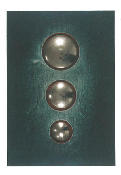
top Way to the Seung-ga Temple (detail), 2017, multichannel slide projection in loop and installation, dimensions variable