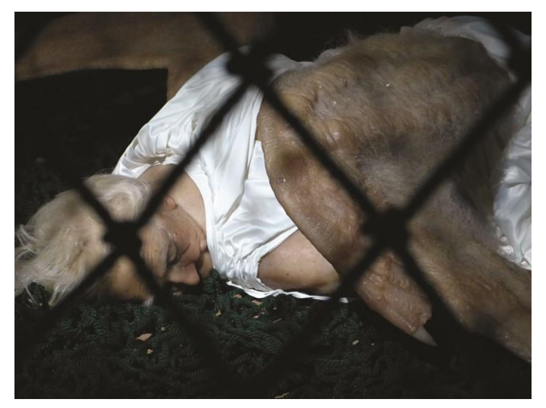
Sun Yuan and Peng Yu, Angel (2008).