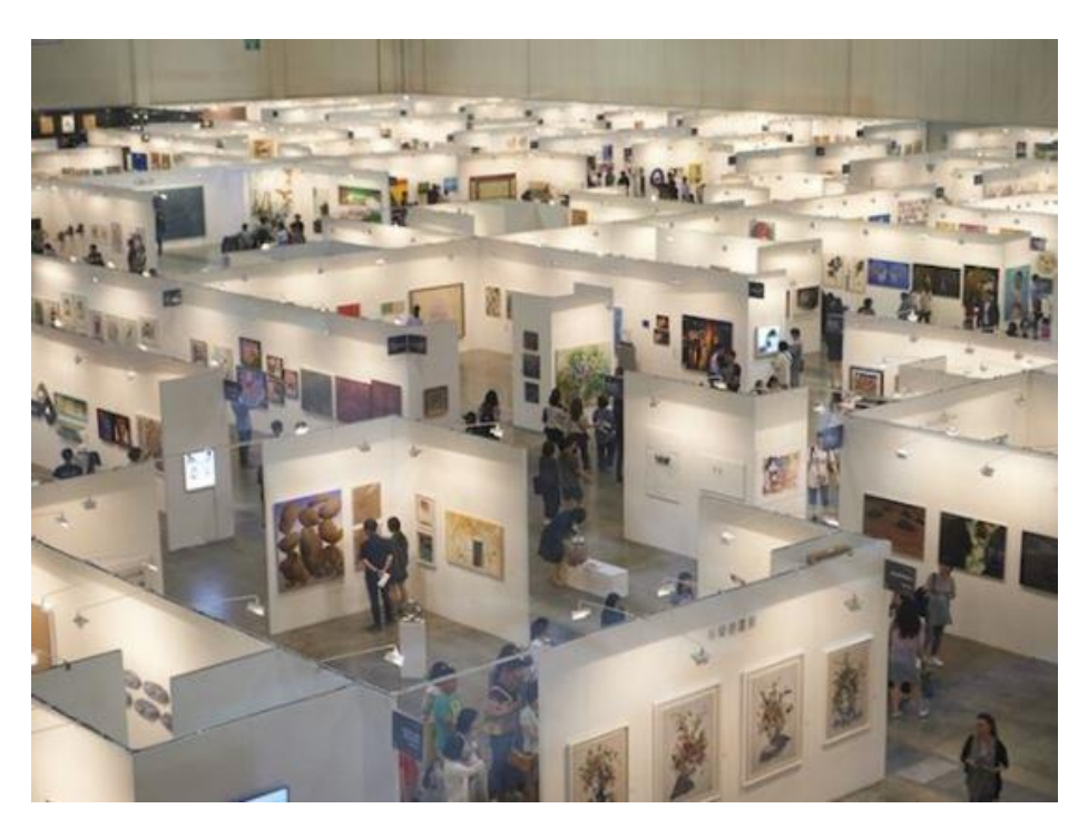
Art Busan 2017 (2–5 June 2017).

National tensions were high in the weeks leading up to Art Busan (2-5 June 2017). Three days before the opening of the fair in the South Korean port city, an article in the Korea Joongang Daily announced that due to an ongoing diplomatic feud between Seoul and Beijing over a United States antimissile system, fewer Chinese galleries would participate at this year's edition. (The prediction was correct: the number dropped to three Chinese galleries as compared to fifteen last year.) Across the Korean Demilitarized Zone, yet another sinister nuclear test by Kim Jong-un added to the uncertainty in Seoul, but down south in Busan, the atmosphere was considerably more relaxed. With a population of approximately 3.6 million, long sandy beaches and dense commercial districts, Busan is the second largest city in the country—billed as both the 'San Francisco of South Korea' and the cultural and economic centre of the region. Each year, the trading port on the southeastern tip of the Korean Peninsula plays host to the Busan International Film Festival (one of the most popular film festivals in Asia), while the Busan Biennale—curated last year by Yun Cheagab, director of HOW Art Museum in Shanghai—is a major fixture on the cultural calendar. While many of Busan's museums are attached to the city's universities, the Busan Museum of Art is in the affluent neighbourhood of Haeundae, directly across from the fair at Busan Exhibition and Conference Centre.