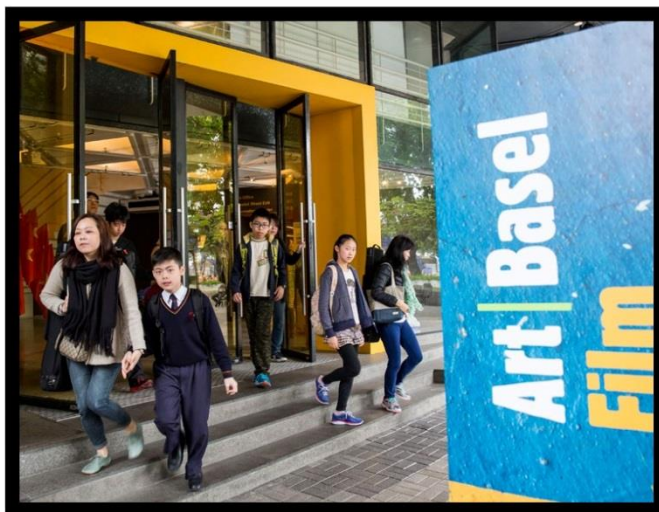
This page, top to bottom: General Impression of Art Basel in Hong Kong 2015; The Rats who build the Labyrinth from which they plan to escape , 2015, Jess Johnson.

Within the Insights sector, 28 galleries will present curatorial projects, with half of the galleries presenting modern works – the most yet – and the other half with contemporary works in both