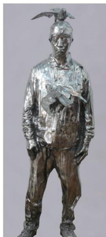
This page, top to bottom: Square No. 1 , 2015, Zhang Dali; Shall Be Released (detailed view), 2015, Richard Mosse.