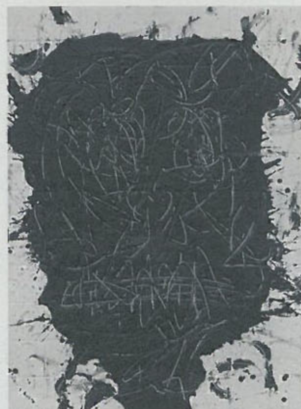
Untitled Anxious Men, 2014