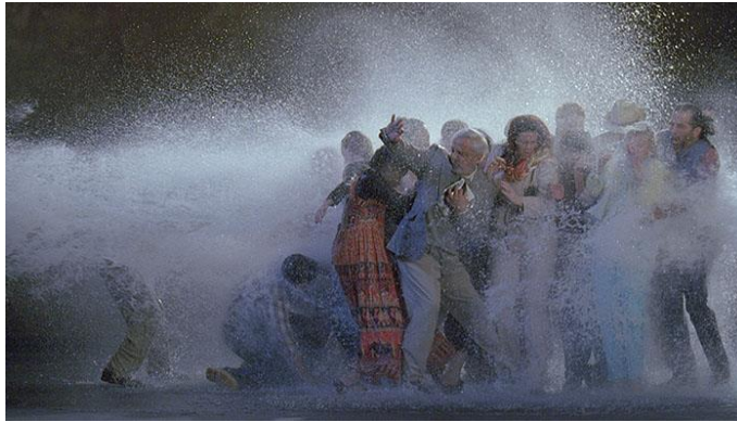
Bill Viola: The Raft (2004). Video/sound installation.