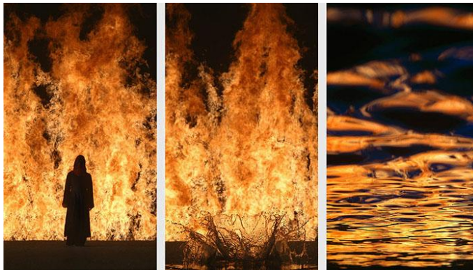
Bill Viola: Fire Woman (2005). Video/sound installation.

Such pieces benefit from being set in sacred structures where the surrounding space has been created for long and quiet contemplation. For Kira, it is as if “a special resonance is created between the works and the environment that informs not only the work, but gives new life to the building”.