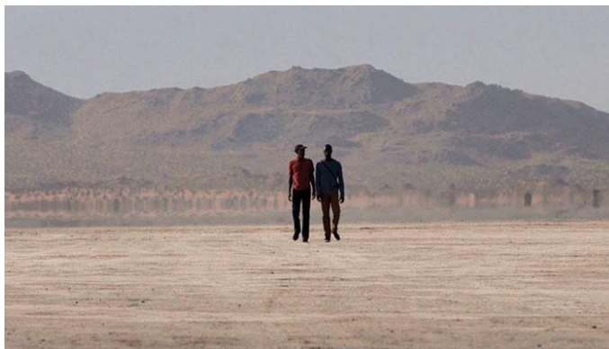
Bill Viola: Walking on the Edge (2012), one of The Mirage series, courtesy the artist and Blain Southern [1].