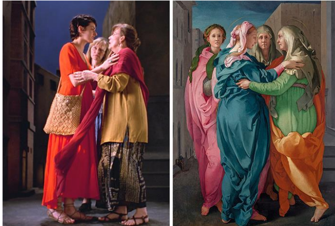
Left: The Greeting (1995) by Bill Viola. Video/sound installation.