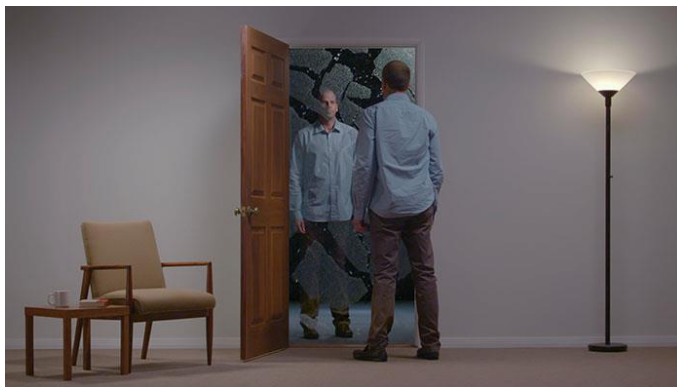
Bill Viola: Angel at the Door (2013). Courtesy the artist and BlainSouthern [1].