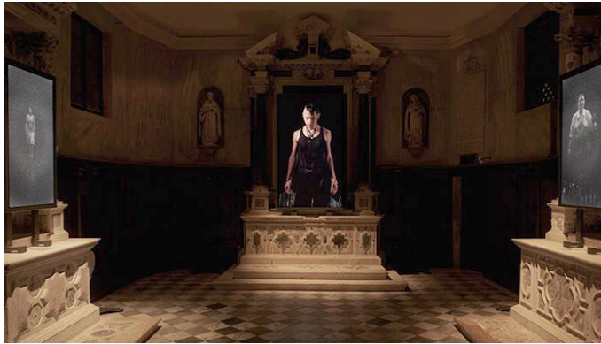
Bill Viola: Ocean Without a Shore (2007). High-definition colour video triptych. Installation view, Chiesa di San Gallo, Venice, Italy.