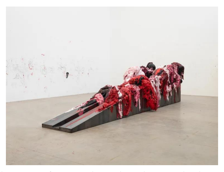
Anish Kapoor, Sacrifice , 2019, steel, resin. Above: The Unremembered , 2020 Steel, canvas, silicone, paint.