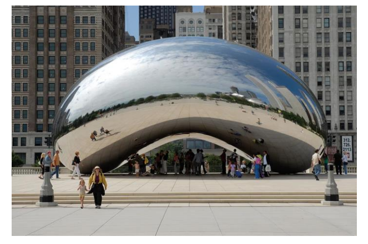
Cloud Gate, nicknamed "The Bean," remains a draw in Chicago. Patrick Pyszka

"When it first opened there were thousands of people, and, as ever, I go, 'Oh no, what have I done? Disneyland, it's so popular,'" says Kapoor. "And so, I decided to go to Chicago and sit with it, and I sat with it for two or three days, and I realized something. Going back to scale, I realized it's a big object and not a big object, a big object and a small object. It has no joints at all; you can't tell how big it is. When you're near it, it's enormous, and when you step back from it, it's not that enormous. The shifting scale felt to me, in my terms at least, there's a poetic quality to it. And for me that saved it."