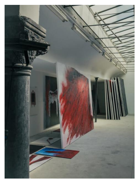
Both Kapoor's wax and silicone works, often on canvas, led him to painting as "a logical step," he says. Many of the works in his studio remain untitled.