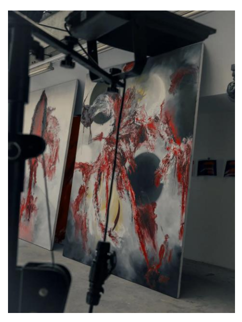
"In my heart, I'm still a sculptor, even if I'm making paintings," says Kapoor.