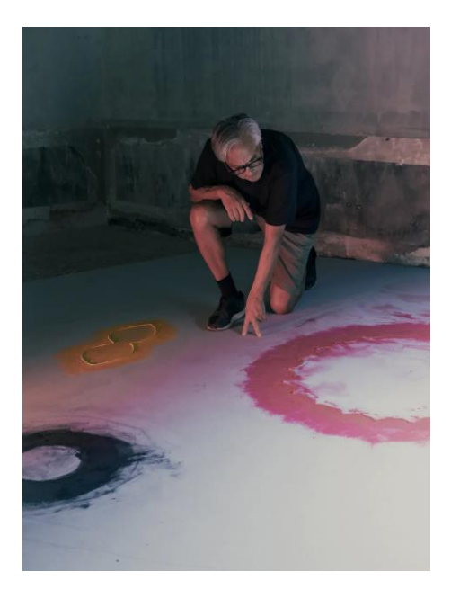
Known to appreciate the "non-object," Kapoor examines piles of pigment at the palazzo where a multicolored mixed-media work, White Sand, Red Millet, Many Flowers, once stood.

Fractal towers of powdered pigment were removed, part of another piece from the Kapoor archive, White Sand, Red Millet, Many Flowers , leaving behind colored outlines on the floor. "It's the absent work," says Kapoor as we walk through the space. The piece, which dates back to 1982, is a variation on his early breakout pigment series, 1,000 Names , which was inspired in part by the colors of India following his first return trip after art school in the late 1970s.