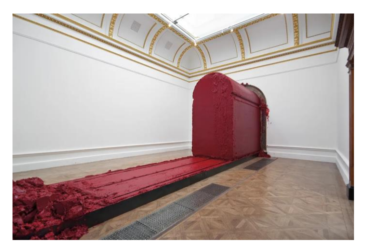
The wax- and oil-based Svayambhu moves slowly through the Royal Academy of Arts in London, leaving a sticky trail of goo.

Still, there's sometimes a prankster quality to Kapoor's more provocative work. "I quite like being naughty and controversial," he says.