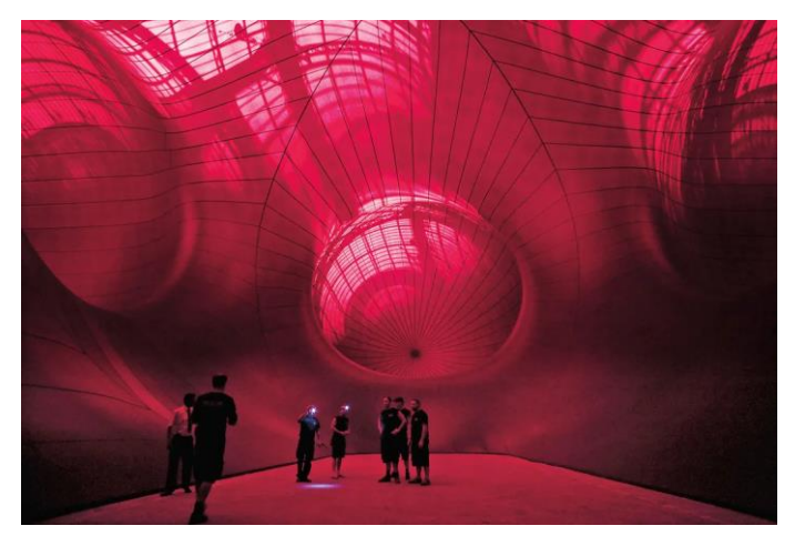
Visitors step inside Leviathan , a giant inflated structure at the Grand Palais in Paris.