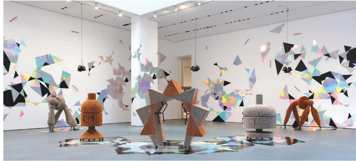
View of the exhibition “Haegue Yang: Handles” , 2018, at the Museum of Modern Art, New York.

generations of sculptors: the relation between nature and the accumulated cultural debris that now fills the industrialized world. Instead, she intuitively responds to an emerging world that is increasingly occupied by autonomous technological objects: machines that can move independently and communicate with each other, existing almost entirely outside of human consciousness. For Bourriaud, Yang epitomizes a new generation “for whom art represents a point of passage between human and non-human.” By placing things and human beings on an equal footing, he maintains, Yang “establishes connections between the entire set of components existing in the world—everything is able to gesture or speak to us if we listen carefully enough.”