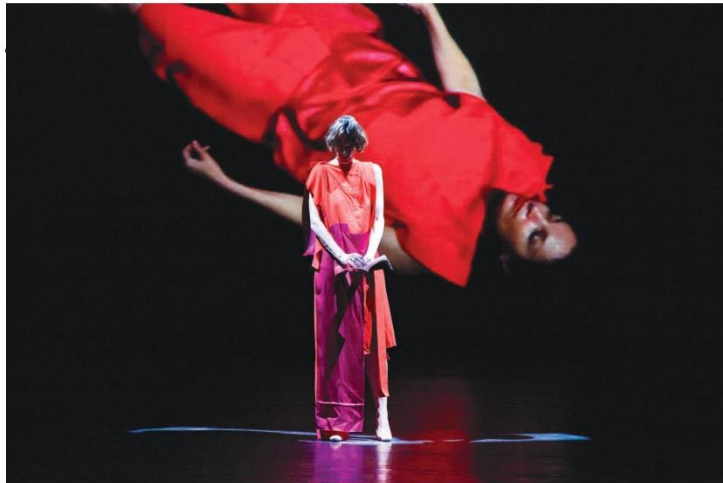
Yearning Melancholy Red (detail)

Yearning Melancholy Red conjures up the langorous heat and humidity of colonial-era French Indochina, where Duras spent her childhood. (Duras evoked this milieu in her 1984 novel The Lover .) In the darkened gallery, intense beams of red light shoot out from slowly rotating spotlights, illuminating sets of hanging white blinds arranged in pinwheel fashion. Nearby, a standing floor fan faces a similarly scaled, stand-mounted bank of infrared lamps that emit waves of warm air. Overhead, playing off the geometric patterning of the blinds, a thick tangle of dark electrical wires suggests a jungle canopy. In one corner of the gallery is a drum set that visitors are allowed (though not expressly encouraged) to play. My feeble efforts at some drum rolls, when detected by an audio sensor, interrupted the programmed movement of the spotlights, although the effect proved impossible to control.