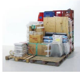
Storage Piece, 2004 , wrapped artworks, palettes, audio player, and speakers, dimensions variable.

quasi-figurative pieces incorporating small bells. The related Sonic Rotating Lines, Ovals, and Geometries use similar bells in wall-mounted pieces that can be rotated by hand. If the works are spun fast enough, their bell-covered surfaces become a blur, making the sound of the bells the predominant impression. The Intermediates appeared around 2015. This sculptural series arose after Yang, during a wintertime trip to Japan, visited a park where trees were wrapped in a protective sheath of woven straw, a practice she had already seen in Korea. Her new interest the Japanese and Korean "strawcraft" tradition led to the sculptures based on quasi-figurative and sometimes architectural motifs. To insure a degree of separation from actual folk art traditions, Yang consistently employs artificial rather than natural straw in making the Intermediates .