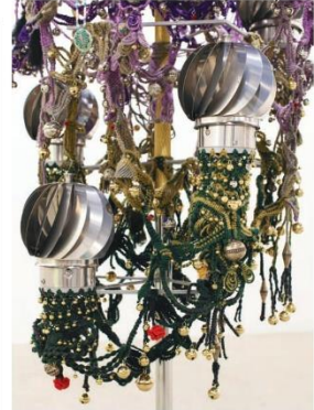
Knotty Spell in Windy Acoustical Gradation (detail), 2017, clothing rack, marbled veneer, jute twine, nylon cord, knitting yarn, bells, vintage jewelry, and mixed mediums, 76 1/2 by 146 by 146 inches overall.

Although some of the Boxing Ballet figures sport armlike handles that seem to invite visitors to roll them around, Yang clearly has unresolved feelings about hands-on audience interaction with her work. Having seen the rough treatment given her wall-mounted, bell-covered Sonic Geometries in museums that permitted visitors to spin them, I can understand her hesitation. The Bass stipulated that the Boxing Ballet figures could be touched and moved only by museum personnel at regularly scheduled times. (MoMA follows similar guidelines in displaying the six Sonic Sculptures that are part of Yang's current “Handles” installation in its second-floor atrium.) When an audience member at the public conversation at the Bass, wondering if the museum was subverting Yang's artistic vision, asked her why visitors could not handle the pieces, the artist said simply, “These works are not my own any longer.” She explained that almost all the pieces in the exhibition belong to institutions and private collectors. Elsewhere, Yang has acknow-