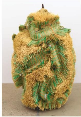
Top, The Internalslate-Dragon Conglomerate , 2016, artificial straw, steel, plaster coating, cotton, and plastic fibers, 70 1/2 by 43 1/2 by 43 1/2 inches.