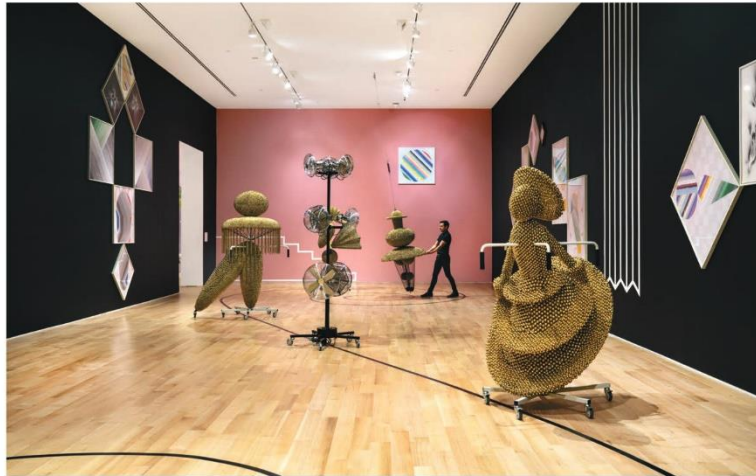
Left: Courtesy Museum Ludwig, Cologne/Photo Susan Whipple. "In the Cone of Uncertainty." Center: the Bass, Miami Beach/Photo Zsuzsanna Balazs.

domestic comfort, these works contrast sharply with menacing images in the wallpaper that covers the room's largest wall: swirling abstractions suggesting violent tropical storm activity and blurry photographic images showing deserted city streets slammed by raging winds and torrential rain.