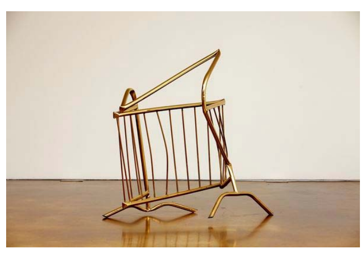
Untitled (barricade) 2010 24 kt gold plated barricade