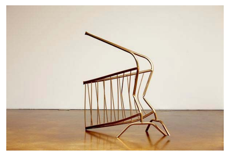
Untitled (barricade) 2010 24 kt gold plated barricade

Use of images must clearly credit the artist and other relevant parties.