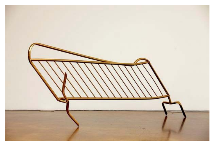
Untitled (barricade) 2010 24 kt gold plated barricade

Use of images must clearly credit the artist and other relevant parties.