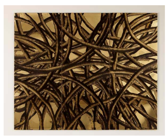
Untitled 2010 brass panel plated with 24 karat gold, burnt rubber, motor oil each panel: 243.8 x 100.3 cm

Use of images must clearly credit the artist and other relevant parties.