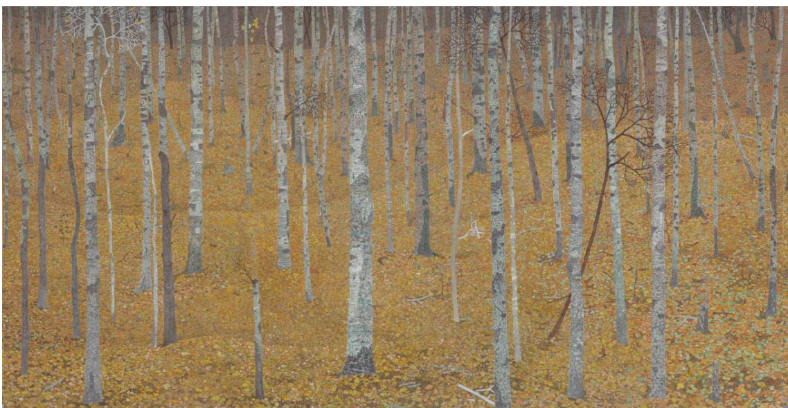
숲의 내부 Interior of a Forest (detail image)