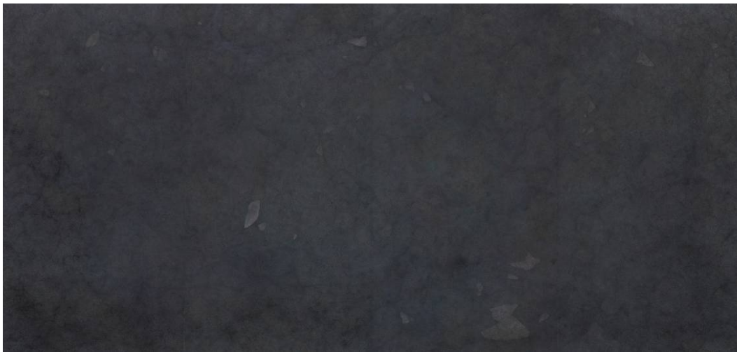
밤의 질감 Texture of the Night 2010–2011