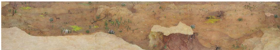
무심한 교차 Absentminded crossing

Use of images must clearly credit the artist and Kukje Gallery