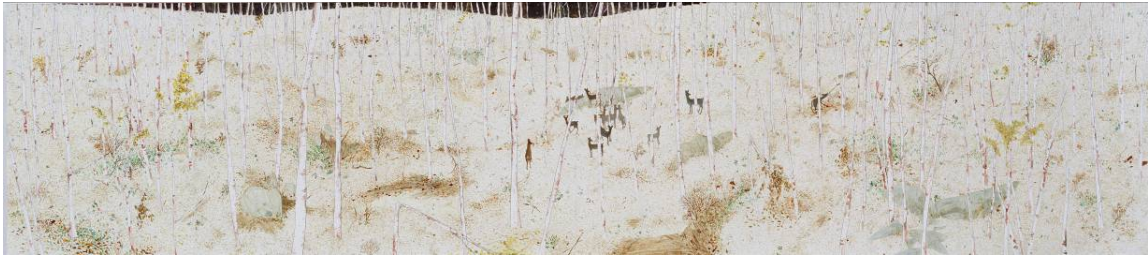
밤 Night 2008

Use of images must clearly credit the artist and Kukje Gallery