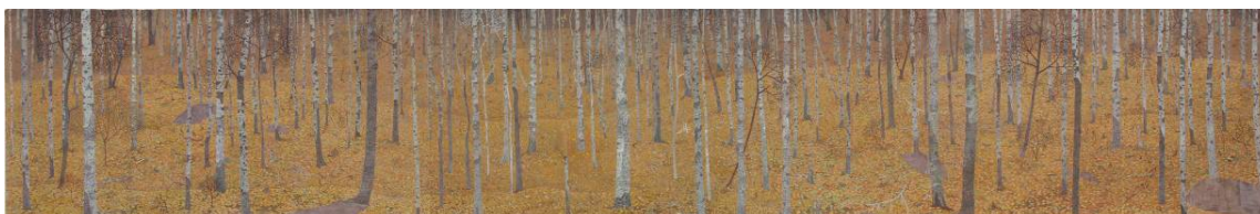
숲의 내부 Interior of a Forest

Use of images must clearly credit the artist and Kukje Gallery