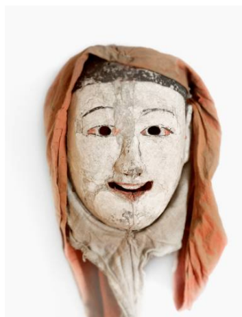
MGM 07 2009

“Courtesy of Koo Bohnchang and Kukje Gallery”