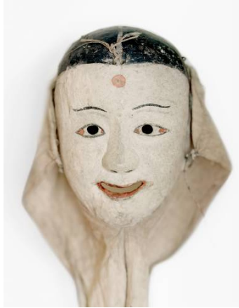
MGM 03 2009

Use of images must clearly credit the artist and Kukje Gallery