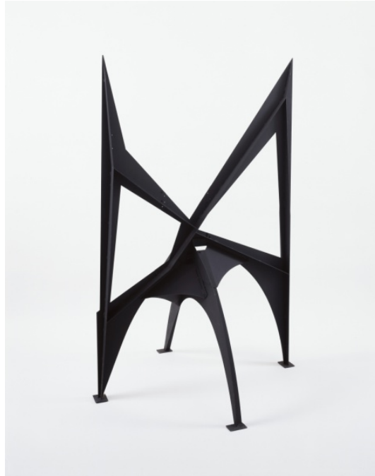
Alexander Calder (1898 – 1976) Morning Cobweb [intermediate maquette] 1967 sheet metal, bolts and paint 64 x 40 1/4 x 40 inches 162.6 x 102.2 x 101.6 cm

© 2012 Calder Foundation, New York / Artists Rights Society (ARS), New York