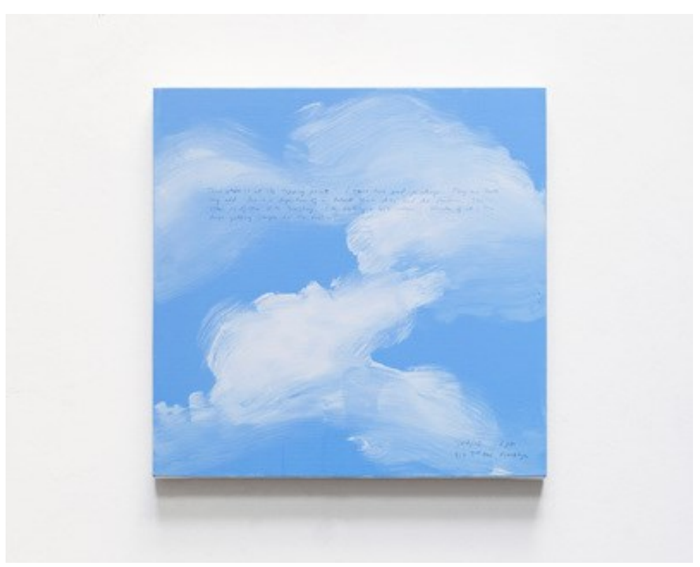
Byron Kim Sunday Painting 1/27/08 2008 Acrylic and pen on canvas 35.5 x 35.5 cm